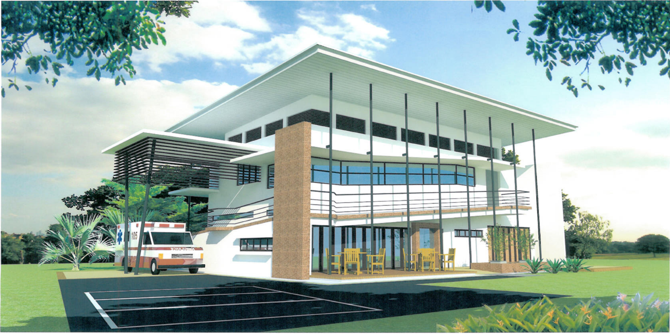
PROPOSAL TO BUILD A DOUBLE STOREY SEMI DETACH HOUSE FOR DAMAI DISABLED PERSONS ASSOCIATION OF MALAYSIA.